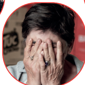
Lyubov Mykolaiv region